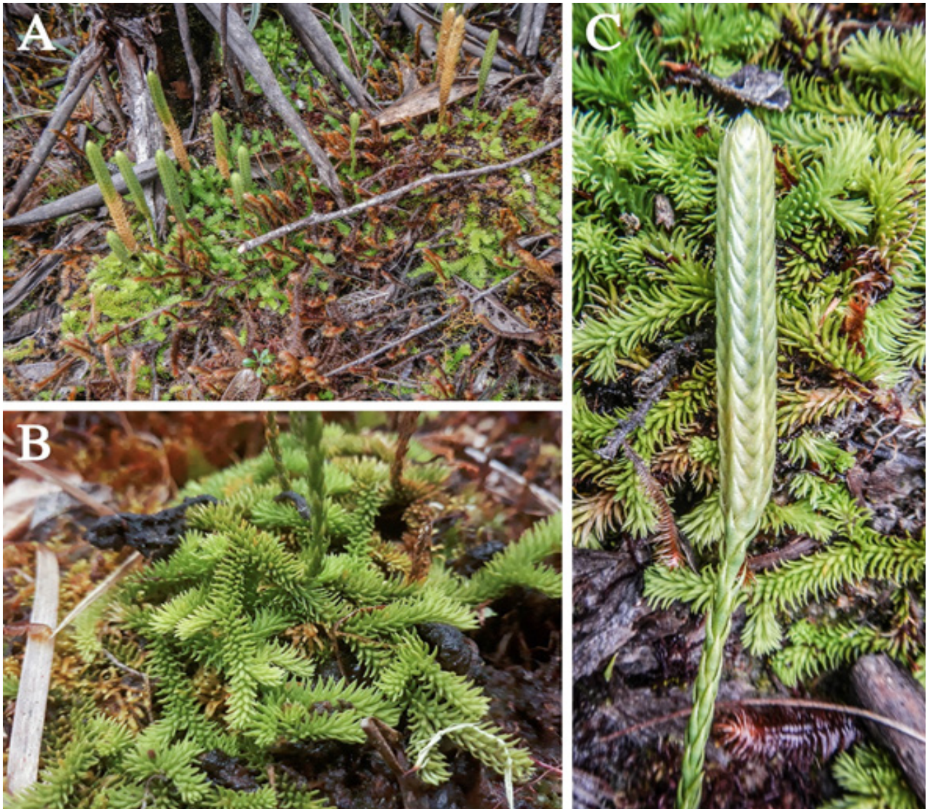
Figura 1. Pseudocyclopediella iuliformis . A. Habitat in Cerro Plateado Reserve; mat growing under thick organic matter surrounded by bryophytes. B. Creeping shoots entirely isophyllous. C. Detail of young strobilus.

covered on all sides by leaves, 4–10 mm diam. incl. leaves. Stems excl. leaves 1–3 mm thick. Leaves of horizontal shoots uniform, usually upward secund and curved, acicular, flattened with a subterete to compressed leaf base (angular when dried), or sometimes terete or angular throughout, 3–6 × 0.4–0.8 (–1) mm, with smooth margins. Leaf bases not, or only slightly acroscopically adnate, short to long decurrent. Erect strobiliferous shoots 3–4 mm diam. incl. leaves, 1.5–2 mm excl. leaves, with uniform, radially arranged leaves. Vegetative leaves of erect shoots borne in alternating, irregular whorls of 3–6, 2–4 mm apart, forming 8–12 obscure longitudinal ranks, appressed throughout, flattened, subulate, ca. 5 × ca. 0.8 mm, evenly tapering. Strobili 2.5–11 cm long, 3–5 mm diam. with appressed sporophylls, to 14 mm in diam. with distended sporophylls. Sporophylls borne in alternating whorls of 5–6, forming 10–12 longitudinal ranks, subpeltate, with a basiscopic, compressed membranaceous wing on the stalk, the exterior face with a widely ovate to rhombic basal part and an abruptly to evenly tapering, long apex, 4–8 × 1.5–2 mm, with finely erose-dentate margins. Sporangia borne on the sporophyll base, reniform, isovalvate, 1.5–2 mm wide.