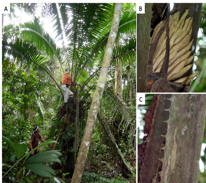
Figure 1 Wild population of E. oleifera from Pastaza Province, Ecuador. (A) An adult individual in the primary forest; (B) Male inflorescence at early stage of development; (C) Spines along of the base of the petiole.

only (i) seed accessions from regional gene banks, or (ii) individuals cultivated ex situ. To the best of our knowledge, no studies of natural populations in situ have been reported. Nevertheless, a study of ex situ individuals from different countries with Simple Sequence Repeats (SSRs) markers revealed that E. oleifera from Taisha (Morona Santiago) are, surprisingly, more genetically similar to populations from Pacific Colombia (Valley of Sinú, Antioquia) than the geographically adjacent populations from the Peruvian Amazonia (Arias et al. 2015). At the phenotypic level, while yield components (FFB-fresh fruit bunches, kg per palm year -1 ; BN-number of bunches, palm year -1 ; MBW-mean bunch weight, kg) were lower for Taisha individuals, other unique qualitative traits were different in comparison with populations from Colombia, Peru, and Brazil, including: (i) 14–21% higher Mesocarp/Fruit (M/F) ratio (63%); (ii) higher Fruit/Bunch (F/B) ratio for parthenocarpic